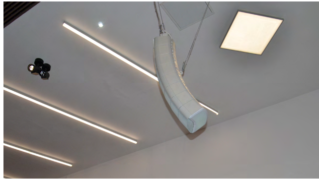
Martin Audio Mini Line Array Speakers